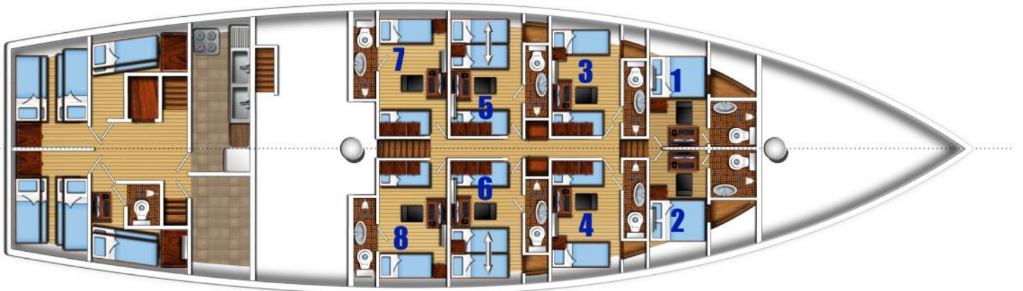
Lower Accomodation Deck