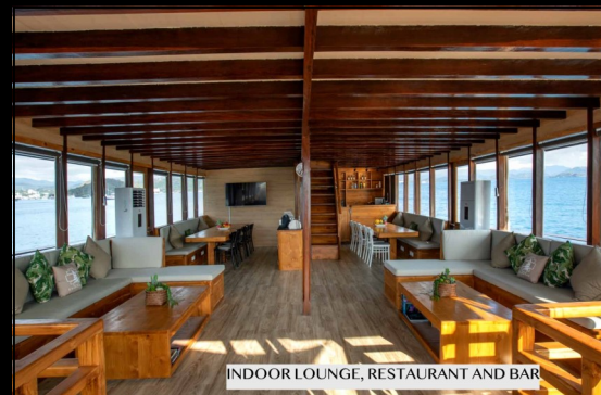
INDOOR LOUNGE, RESTAURANT AND BAR