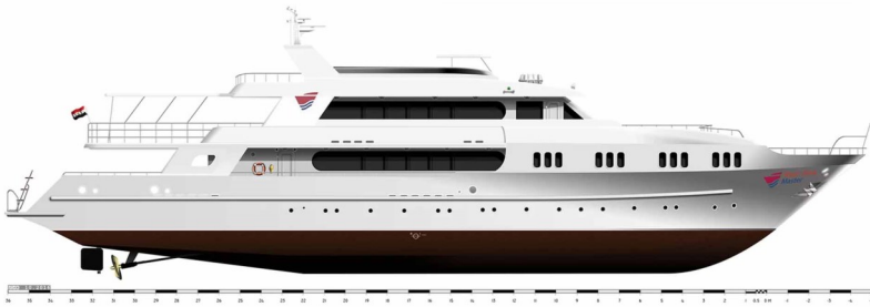
THE MV BLUE HORIZON